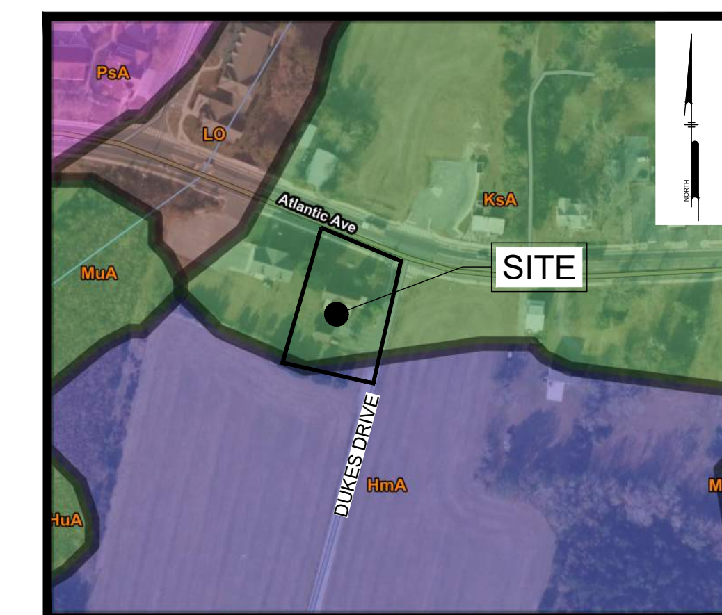
SOILS MAP SCALE: 1" = 200'