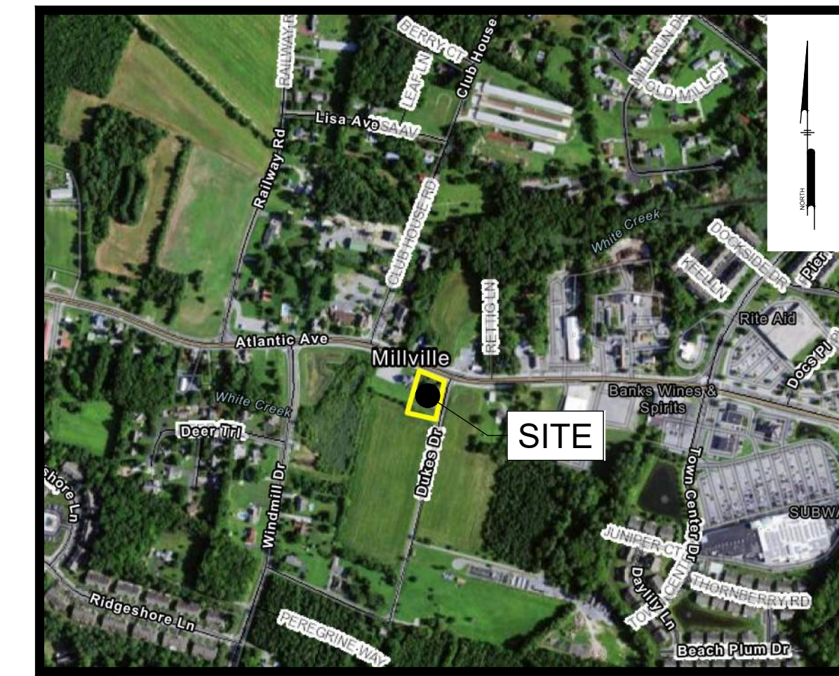
LOCATION MAP SCALE: 1" = 500'