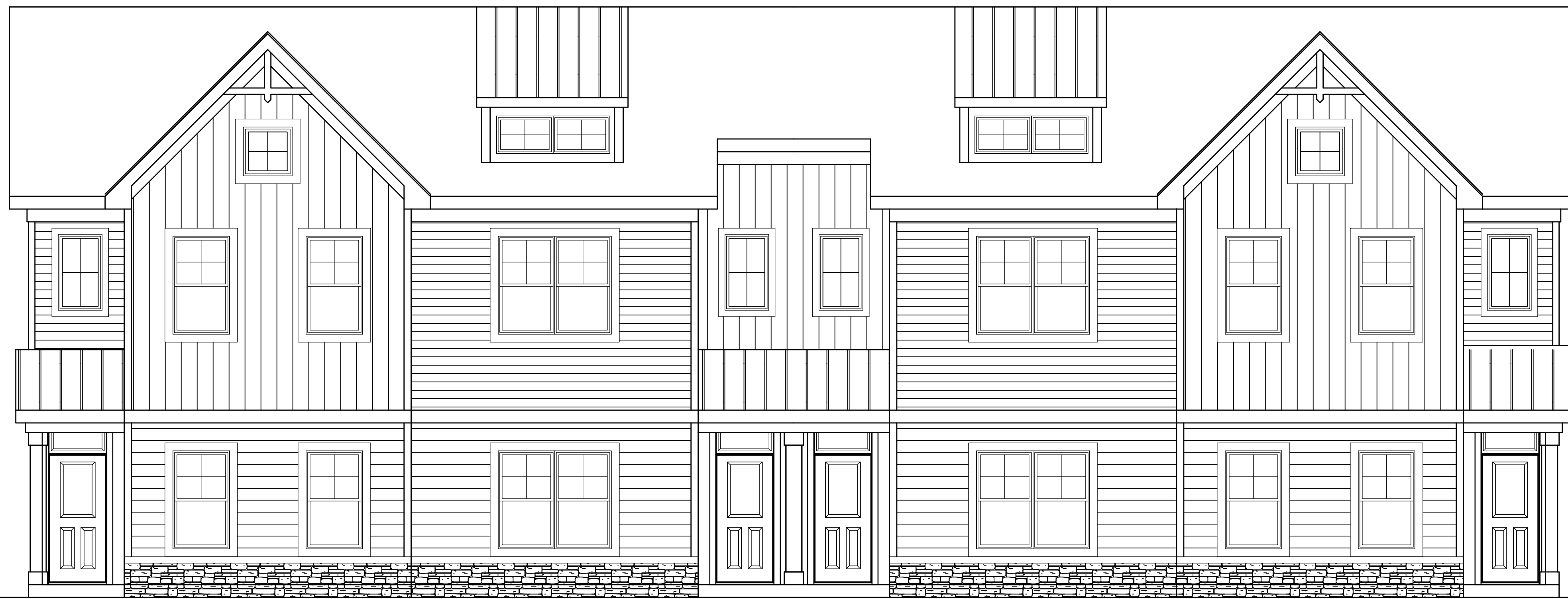
FRONT ELEVATION SCALE: 1/4"=1'