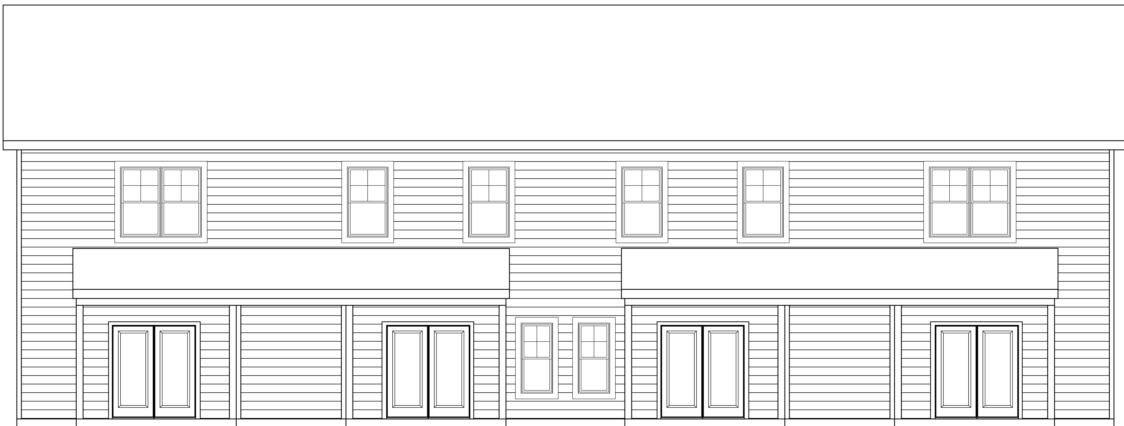
REAR ELEVATION SCALE: 1/4"=1'