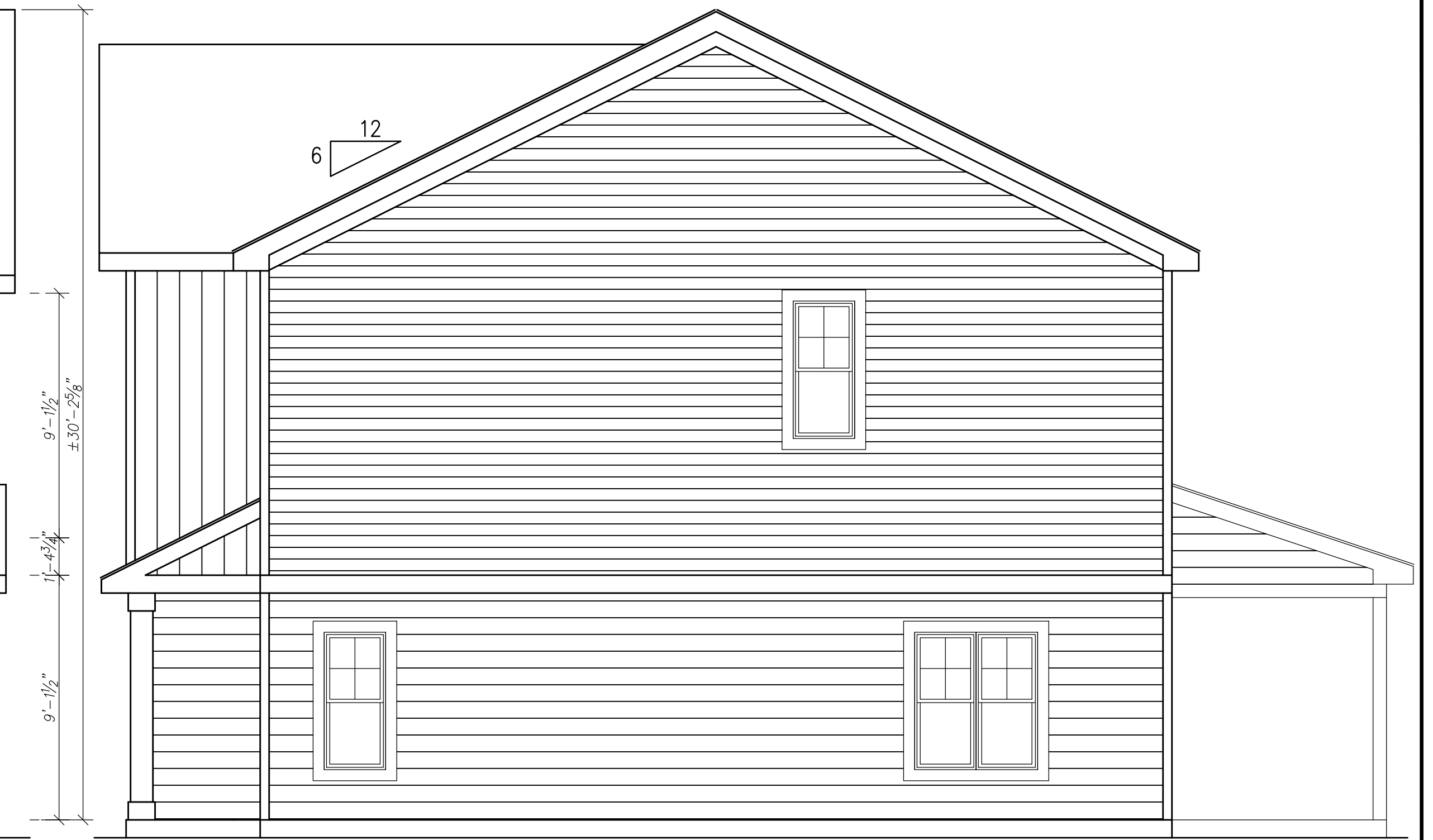
R. SIDE ELEVATION SCALE: 1/4"=1'